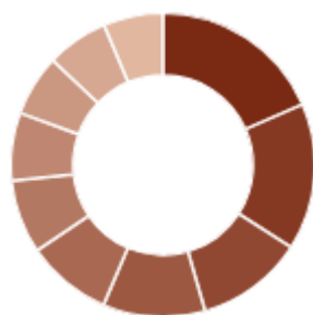
Top 10 Holdings