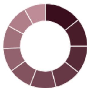
Top 10 Holdings